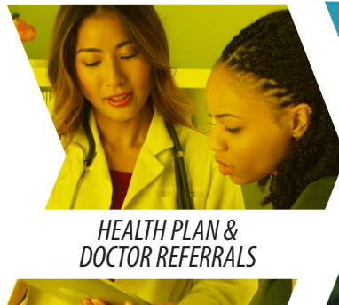
HEALTH PLAN & DOCTOR REFERRALS

Those with low income and educational levels, Medicaid members, and those reporting chronic and/or mental health conditions have the highest smoking rates in NYS. 1 As a result, they can have a harder time quitting and often suffer the most from tobacco-use.