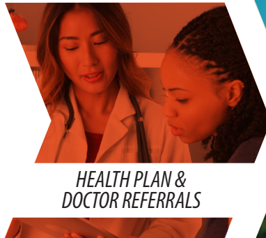
HEALTH PLAN & DOCTOR REFERRALS

When a provider helps a patient to quit, referring them to the Quitline ensures that the chain of support continues – which may give patients a better chance of success. That's why the NYSSQL has increased efforts over the years to grow partnerships with healthcare systems and providers across the state. In fact, since the inception of the Opt-To-Quit™ Provider Referral Program in 2013, statewide provider referrals to the NYSSQL have increased by 253%; with a 43% increase in referrals from 2016 to 2017.