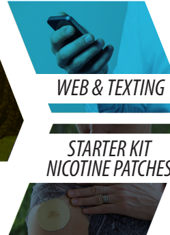
WEB & TEXTING