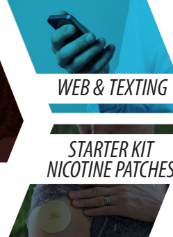
WEB & TEXTING