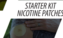
STARTER KIT NICOTINE PATCHES